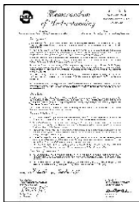
Signing Ceremony of MOU in 1995

This year AJCE and its member firms will be welcoming Australian young professionals in October. I have no doubt that this year's programme will be a big success again, and add a new page to YPEP's long outstanding history.