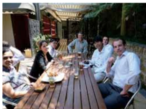
Engineers of Steensen Varming

Despite of my inexperienced English, I could pursue the trainings with satisfaction. I owe much thanks to Steensen Varming for their kindness and hospitality. I would like to extend thanks to CA, AJCE and PTM. for giving me a precious opportunity.