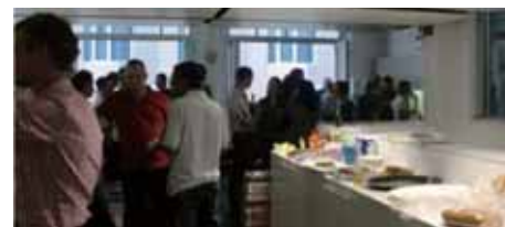
Drinking hour in the office

and exchange opinions. I felt that we need to follow such a good practice.