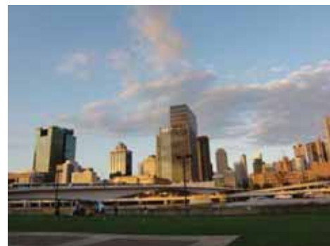
Picture.4: People exercise near river.

Many people are concerned about their health. They exercise everyday by walking, cycling, boxing, etc. after working.