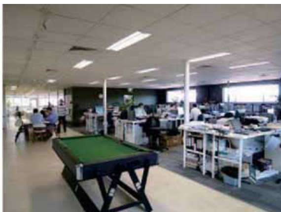
The main office in Sydney

Steensen Varming (SV), my host company is originally a Danish building services engineering firm. SV is based in Australia ever since SV involved in the building services design of Sydney Opera House in the 1960's. Around 30 staffs work at the main office in Sydney.