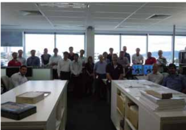
Civil Group at KBR Brisbane office