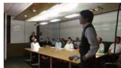
Fig4. Presentation of Exchange Program