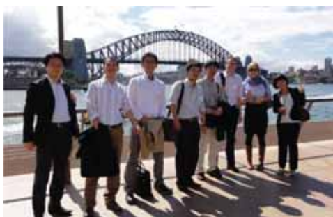
fig1. Group photo at Sydney