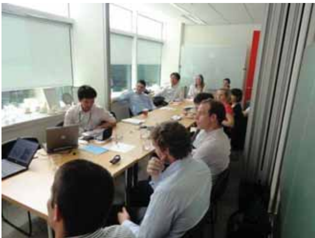
Picture2: Presentation at Young Summit