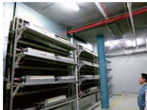
The huge AHU at NGA

On 13 th October, I went to Canberra. The National Gallery of Australia has a huge air handling unit I had never seen before.