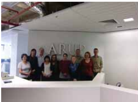
Picture.1: At ARUP Adelaide office

In this year, I had training from 5 th to 22 nd October at Adelaide and Brisbane offices of Arup.