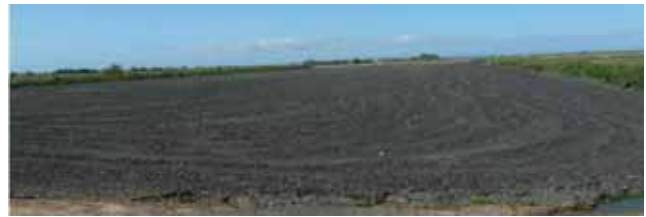
Area of drying sludge in Western WTP

On last day in Melbourne I had a chance to present my outcome in the training. I introduced Japanese wastewater technology to water-group's staffs in Melbourne. I felt they were interested in Japanese technology such as two-story settling tank.