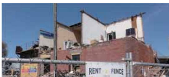
Fig1. Damaged Heritage (need to demolish)