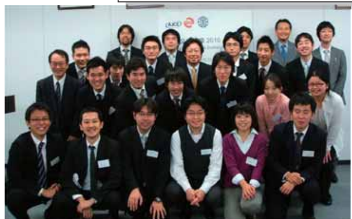
The reporting workshop on YEP2010