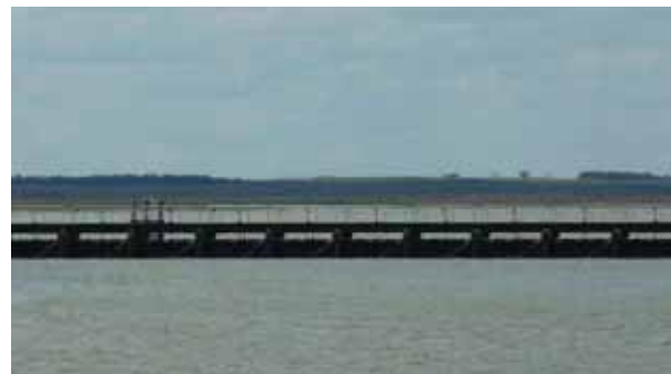
Murray movable dam

When we visited SA Water, we were lucky to meet with four staffs in SA Water and we talked about shortage of water in SA and its countermeasures. In SA one must pay a fine if he uses sprinkling water beyond the limit.