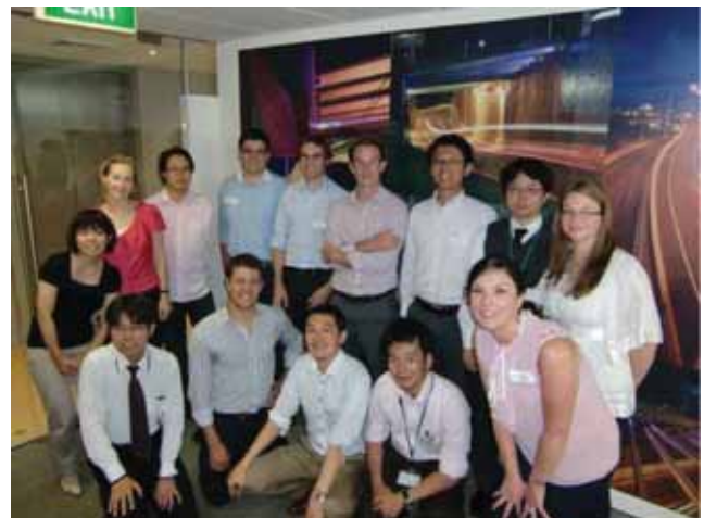
Picture3: After Young Summit

Though we couldn't make impressive English presentation, we could convey our spirit and message to young engineers and CA staffs in Australia. When we speak in English, most important thing would be to express what we want, not beautiful speech. Many non-English speaking foreigners know about this point very well. We have to peel off our misconception that "Japanese is shy". We are as competitive as foreign engineers in technical skills. So let's be proactive as international consultants.