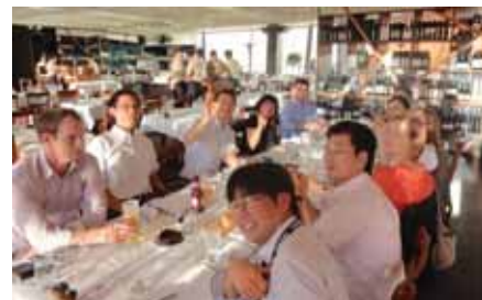
Fig3. Farewell party in the nearby restaurant

After the Young Summit, we had a dinner in the nearby restaurant. Of course, all conversation by the Japanese trainees was in English. Recently, English is used as an official language in international firms. I am certain that all the trainees will acknowledge this trend.