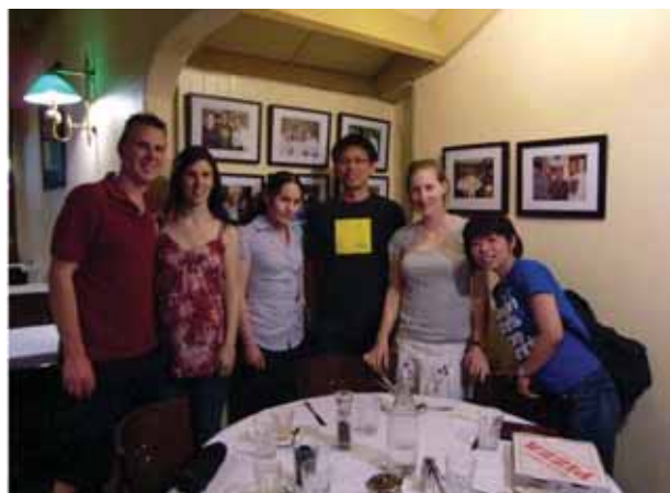
Dinner with Adelaide staffs