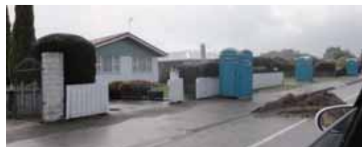
Fig2. Kaiapoi Town (north of Christchurch)