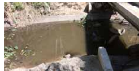
Fig3. Site Survey in South Bank