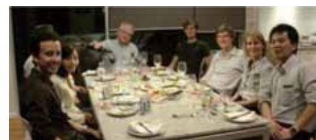
Dinner at staff's home

In the off time, I enjoyed Australia's life with BG&E staff everyday. I enjoyed dinner at staff's home, drinking hour, climbing, sailing, bike ride, surfing, Fremantle visit and more. It was a precious experience for me to touch Australia's unique culture and lifestyle, and to watch Japan from another aspect.