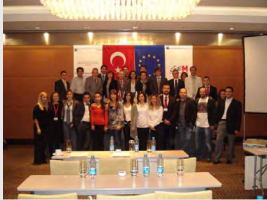
GEM and ATCEA members in family photo at the closing of 1 st GEM Conference