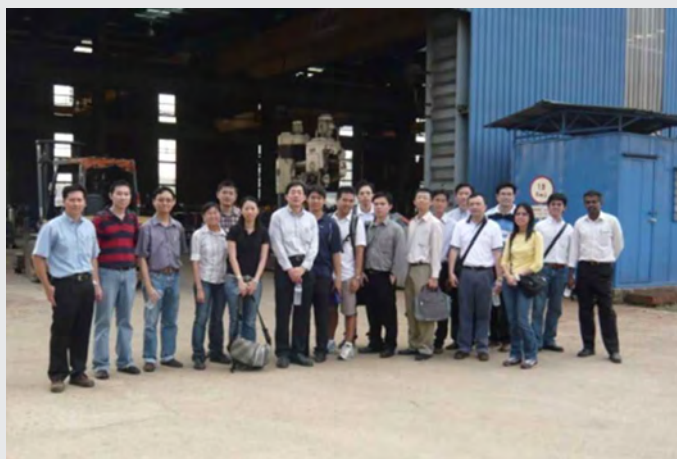
ACES Visit to steel fabrication yard

To date, we have 70 Young Professionals actively participating and benefiting from our activities.