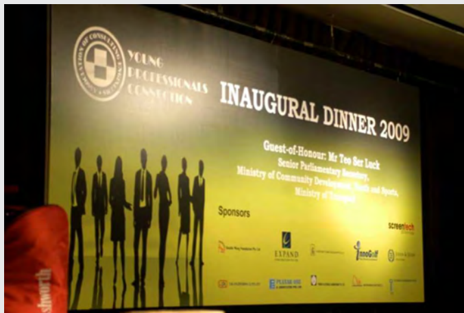
YPC Inaugural Dinner 2009

In May 2009, YPC also successfully organized an inaugural dinner to raise funds for our activities. The occasion was very well received by members of the industry.