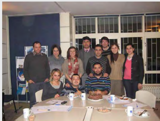
50 th Coordination Meeting was celebrating