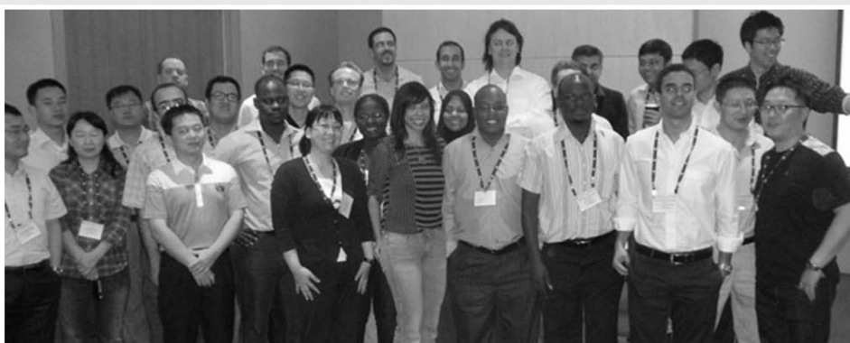
YPMTTP 12 Young Professionals

The virtual sessions were great, but when we all met in Seoul to conduct the face to face intensive workshops, the experience elevated into a new different dimension! The effect of linking the face to the pictures and voices which we got used to during the eight months of virtual sessions was overwhelming. The three groups finally met and the harmony and chemistry that grew amongst the team members were key factors which resulted in very effective communication and negotiation sessions in Seoul. The facilitators were brilliant in choosing hot and interesting topics for the Consulting Engineering Industry which really boosted everyone’s energy to discuss and express his/ her opinion from their own experience, In summary the workshops were interactive, informative and vibrant.