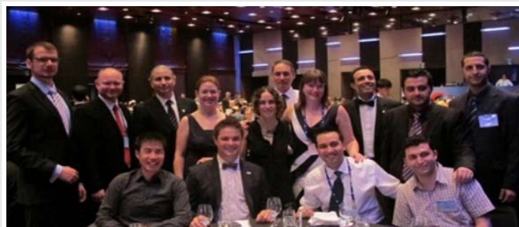
YP Delegates at the Gala Evening

conference from Monday the 10th of September to Wednesday the 12th of September . With more than 10 sessions in the program, YPs could choose their desired sessions based on their specific needs. The exchange of ideas and thoughts on international sustainability issues generated new creative initiatives for YPs to work on, back in their